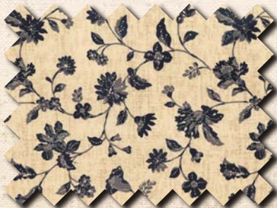
4105-K 1\frac{1}{4} yards