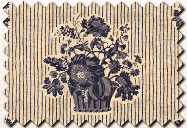
4104-K *1\frac{3}{4} yards