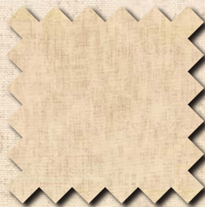
3498-N \frac{1}{2} yard