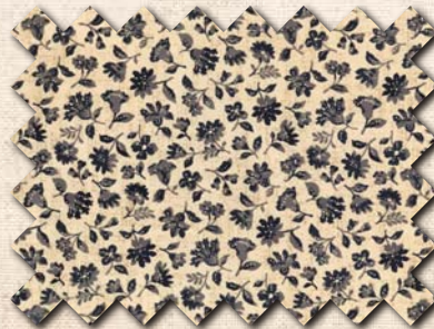
4106-K 1\frac{1}{4} yards