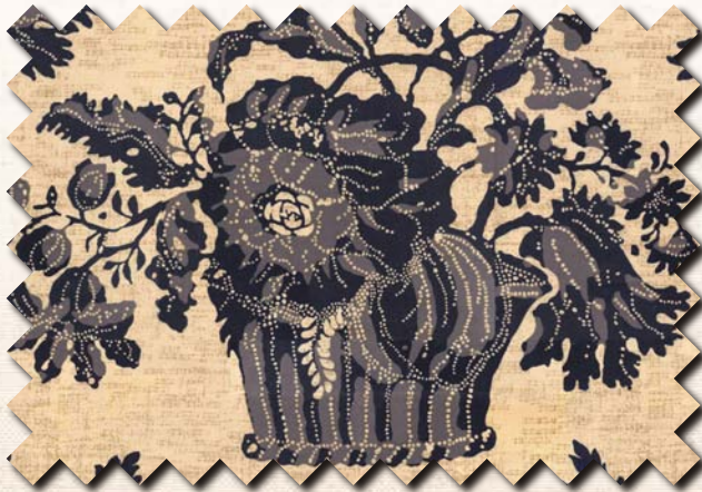
4103-K \frac{2}{3} yard (1 full bouquet, centered)